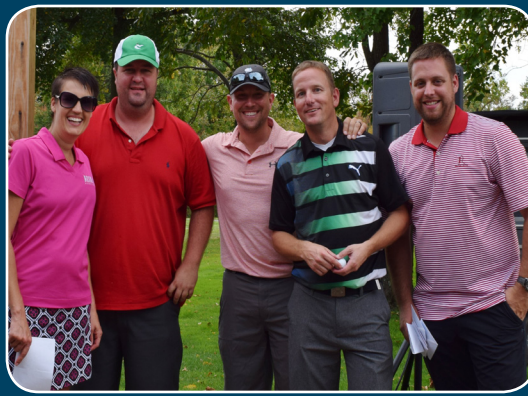
2nd Place Winners from PPSI