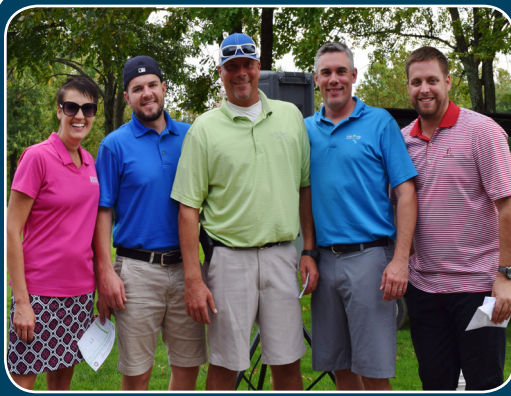
1st Place Winners from C.A. Lindman